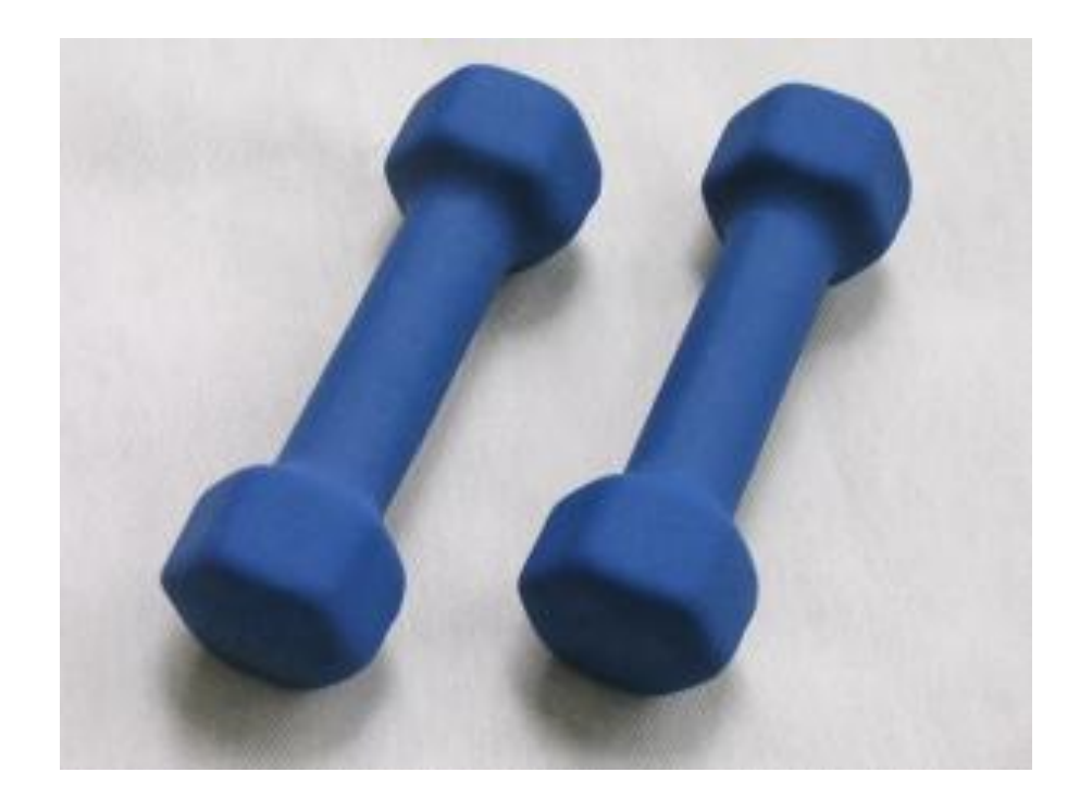
Fitness Video Vibes The 10 Hottest Workout Videos You Can Learn From

Everyone knows that they need to stay in shape. One of the best ways to do that is with fitness videos. Get all the info you need here.