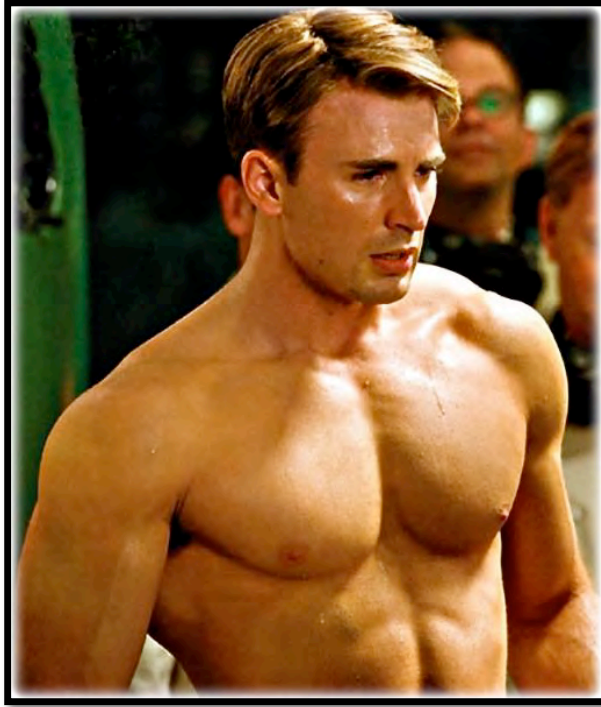
Chris Evans physique during the Captain America: First Avenger film(2011)

workout is suitable to those who have been training for over 6 months consecutively and want to shift towards a different workout plan.